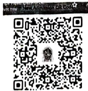
Qviple Admission App