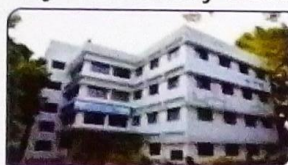
Sir Dr. M. S. Gosavi College of Pharmacy