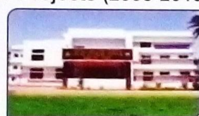
Katgara Polytechnic Institute, Bordi.