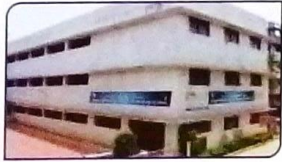
Arvind Manohar Kulkarni School, Nashik