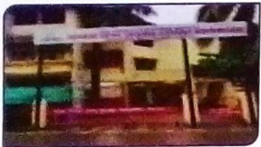
Law College, Kharghar