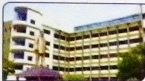
R. H. Sapat College of Engineering & Research