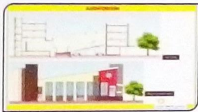
Guru Dakshina Auditorium, Nashik