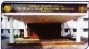
Sir Dr. M. S. Gosavi Polytechnic Institute