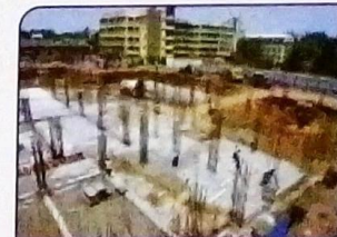
Hospital Work in Progress