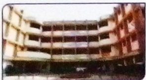
Sir Dr. M. S. Gosavi Inst. of Nursing Sir Dr. M. S. Gosavi College of Physiotherapy